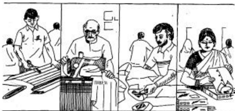
Figure 20.2 Division of Labour in Manufacture